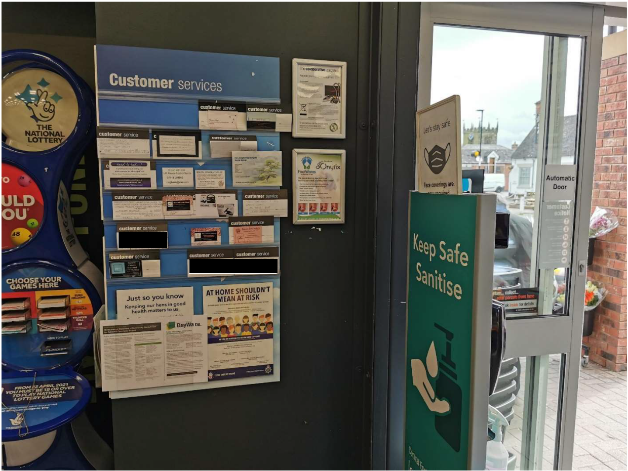
Tesco Superstore – Burton on Trent